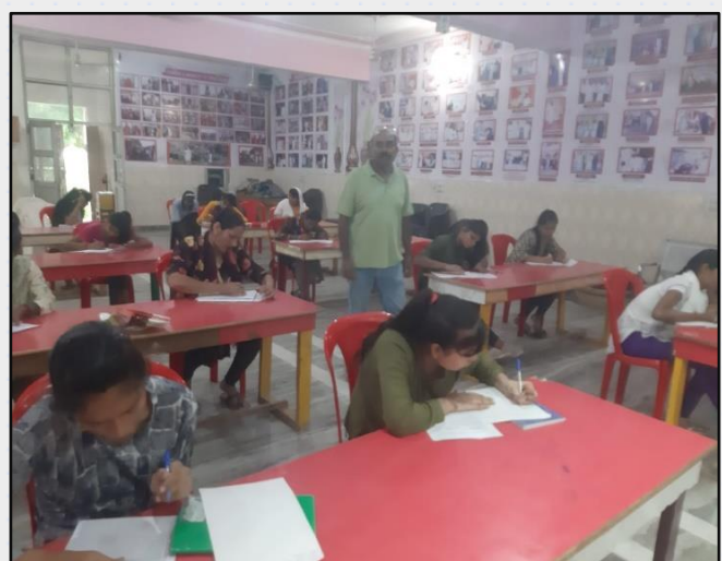
Professional Students writing Initial Assessment Test