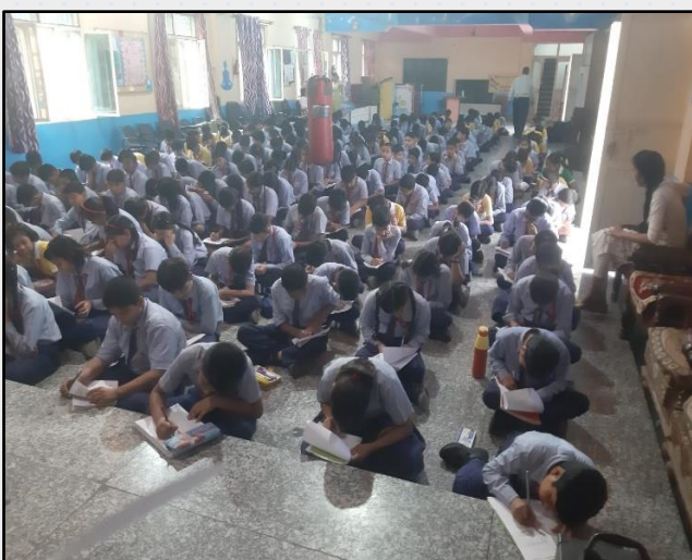
School Students writing Initial Assessment Test

We test students with the school authorities present. This helps us show a clear picture. Based on our experience, if we test 100 students from 6th to 12th grade, 75% will be poor, 13% below average, 10% average, and only 3% excellent. We know this might be surprising, but don't worry. We have a skilled team and modern tools to help.